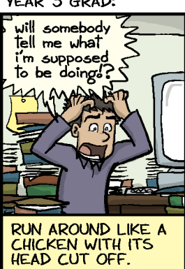
YEAR 5 GRAD: