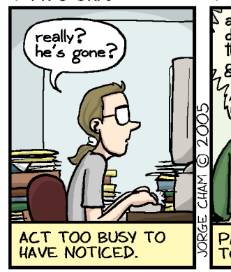
YEAR 7 GRAD: