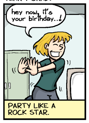
YEAR 3 GRAD: